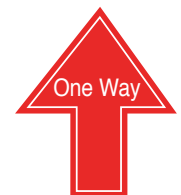
15" W x 18" H

We don't just help brands deliver smart marketing, we help you Market Smarter.